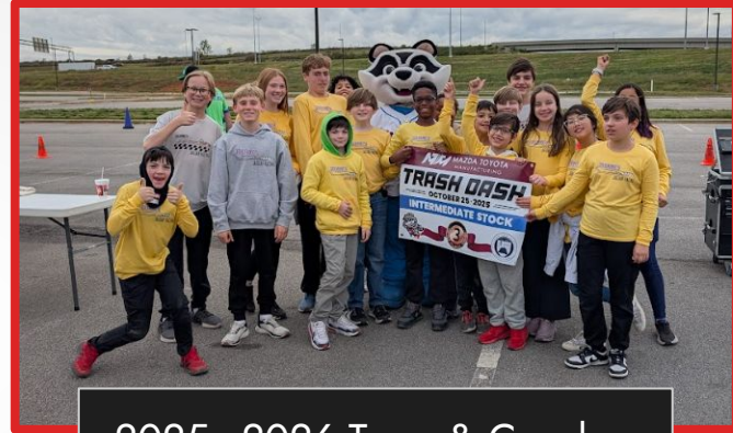
2025 - 2026 Team & Coaches