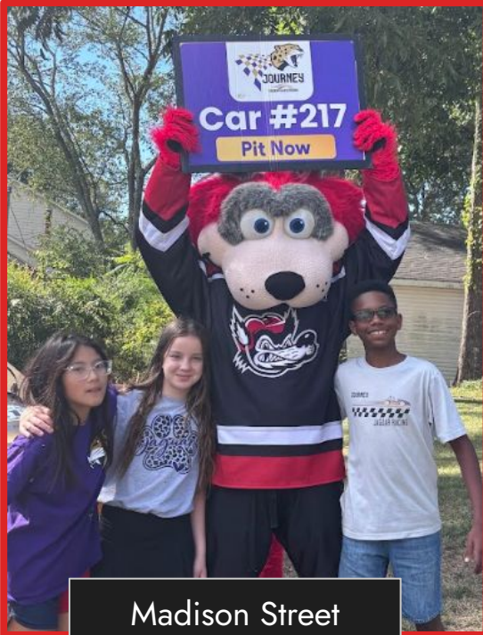
Madison Street Festival